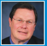
Mark Stodola Mayor of Little Rock Arkansas