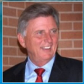
Mike Beebe Governor State of Arkansas

UNDER THE DISTINGUISHED JOINT PATRONAGE OF